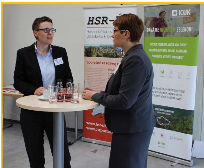
Figure: Conversation at the transnational transfer promotor event in Bautzen.

“In the year 2025 the trinational border region Saxony, Lower Silesia and the Ústí-district is characterised by a lively exchange of knowledge and new technologies. Polish, Czech and German universities and research institutes are working jointly together to bring latest scientific findings and technologies into practice and industrial use to the benefit of European firms.”