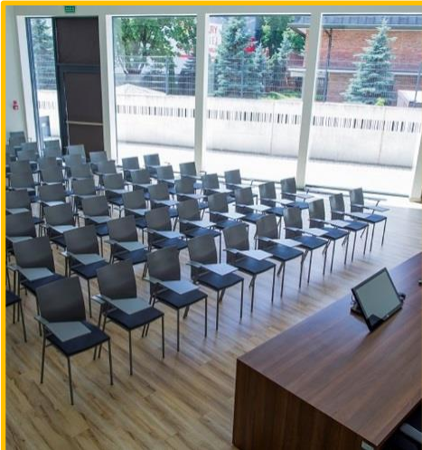
Figure: Venue at the University of Science and Technology in Wrocław.

On 10 October 2017 the workshop „strategy for a transnational cooperation network of transfer promotors” takes place from 9 am to 3 pm at the Wrocław University of Science and Technology. Target of the workshop is it to collect final inputs for the strategy of the intended network, discuss about objectives and framework conditions and to receive feedback from policymakers of all three regions. At the end the strategy should be approved to go further with the implementation of the project aim.